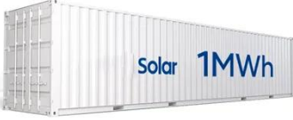
Standard 40ft containers

Panel?What Is The Amount of Current (AMPS) That A 20-Watt Solar Panel produces?What Can A 20-Watt Solar Panel Run?Does A 20-Watt Solar Panel Require A Charge Controller?What Is The Average Cost of A 20W Solar Panel?How Long Would A 20-Watt Solar Kit Last?Can 20-Watt Solar Panels Power Gate Openers?Can 20-Watt Solar Panels Power RV Batteries?What Are Some of The Best 20-Watt Solar Panels available?Under optimum conditions, a 20W solar panel can create 1.34 amps per hour. For example, under perfect conditions, the panel will produce 20 Watts for 7 hours per day, 7 days per week, for 980 Watts. To reduce total charging time, you can connect several panels. You may double your production and cut your costs by installing a second panel with the See more on solvoltaics RenewableWise