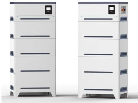
Photo: Solar Home System Photovoltaic System