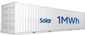
Standard 40ft containers